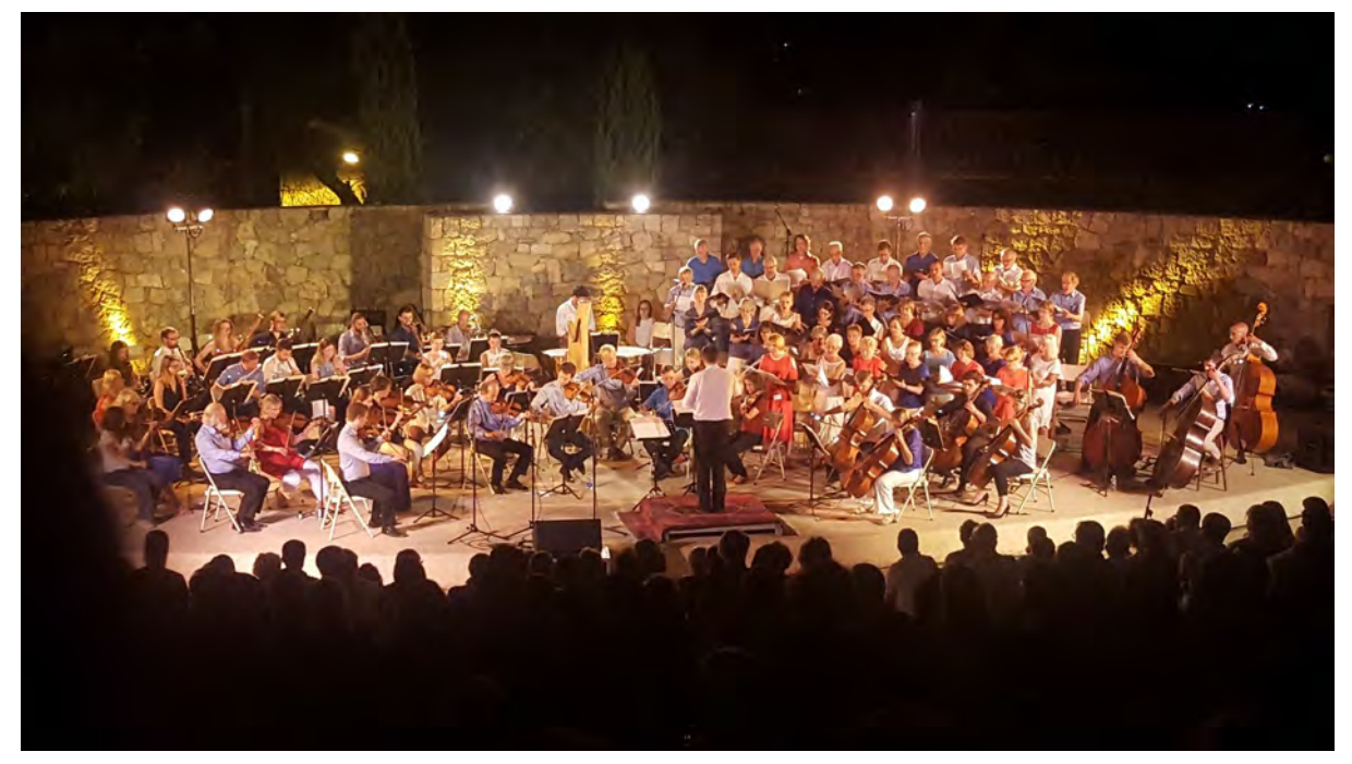
Menton near the Italian-French border beside the Mediterranean. During the most recent Festival, our 20<sup>th</sup>, 30 July – 10 August 2024 , Musique-Cordiale also semi-staged 2 opera performances of Verdi's La Traviata beside the bell-tower in Tourrettes and we were able to open up a remarkable new venue for another outdoor performance of the Requiem in a new public park beside the old (disused since 1948) railway station in

ly, Oratorios of Handel and Mozart and Mozart's Coronation Mass, fitting for the year of 2023, and the glorious Requiem by Verdi in Seillans church, for which we also staged a performance in the Anglican church in