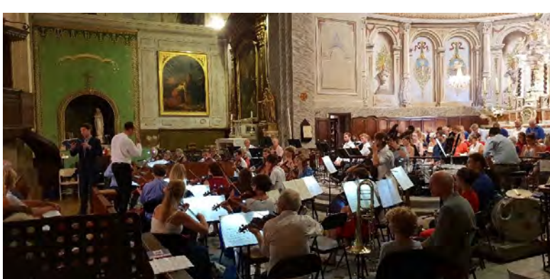
able, in 2022, to celebrate having put on festivals and concerts for 18 uninterrupted years, a feat that made us relatively rare in those pandemic times, albeit that the past 2 years had not been the same and notably lacked too many of our loyal supporters and participants and lacked the pan-European appeal. These performances in our 17<sup>th</sup> year,

roundings as the evening sun faded dramatically, and more indoors in Newnham, Doddington and Faversham where we have earned new loyal audiences during the pandemic years. In doing so, Musique-Cordiale was