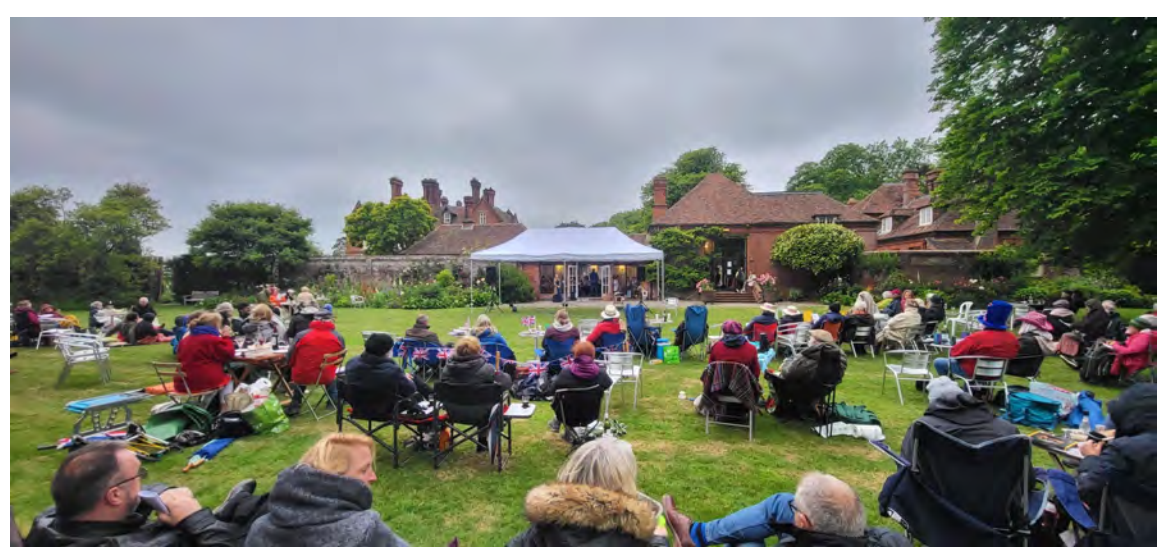
Summer 2022 Concert en pleine aire in Kent